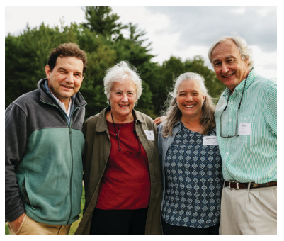
We offer special thanks this year to the Board of the Children's Oral Health Network of Maine for the past 5 years of hard work to get this Network launched. We appreciate their solid dedication and management of the resources that make it possible for the Network to do its work!